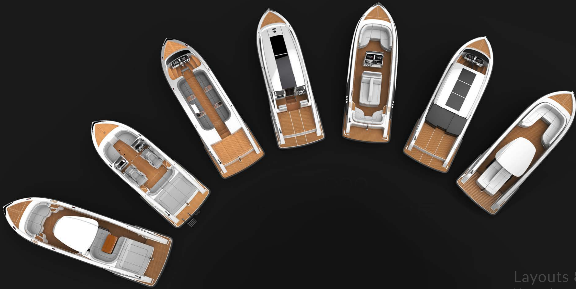
Layouts 8 m to 9.5 m Limousine, Open Tender and D-Rib